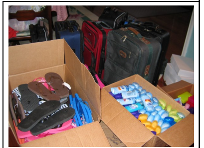
These items were taken to McKimmie Place in April.

The following items are now being collected: Plastic soap dishes (travel size); Plastic Toothbrush holders or toothbrush covers; Small umbrellas (collapsible for storage); Sugar to make the tea at supper times; Large trash bags 45 to 50 gallon size; 22" roller suitcases. A collection box is in the Lobby of the church.